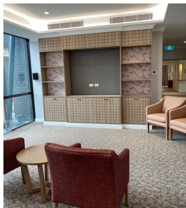
One of the sitting rooms

KOPWA Office is moving! The new facility next door is ready and we are moving office . It is a beautiful building with lots of light and foliage with large rooms. Everything is tastefully designed and if some of you would like to visit mention it to your carer and we will organise it.