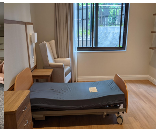
One of the bedrooms